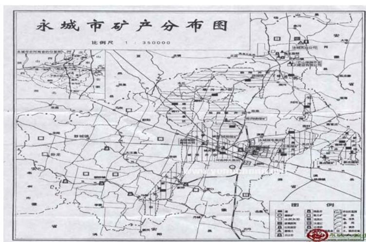
Fig. 1 Distribution of Yongcheng Minerals

The coal of Yongcheng Mining Area is dominated by anthracite [10] , and the annual output of raw coal is 23 million tons. It is one of the six major anthracite coal bases in the country and is also an important coal chemical base in Henan, Shandong, Jiangsu, and Anhui. At the same time, it is also the National Development and Reform Commission. It is one of the seven largest coal chemical bases in the country. In recent years, the annual production of raw coal in Yongcheng Mining Area is shown in Table 1: